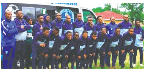
Fetakgomo United FC were crowned SAFA Sekhukhune Regional Football League Champions