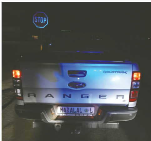
The Ford Ranger bakkie that was hijacked from the victim at Caltex Filling Station in Jane Furse and later abandoned by the suspects at Ga-Masemola Village.